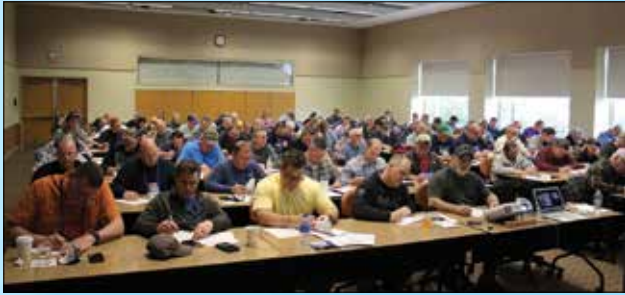
EXHIBIT HALL FINALE

Earn up to 6 Contact Hours, with lunch between sessions!